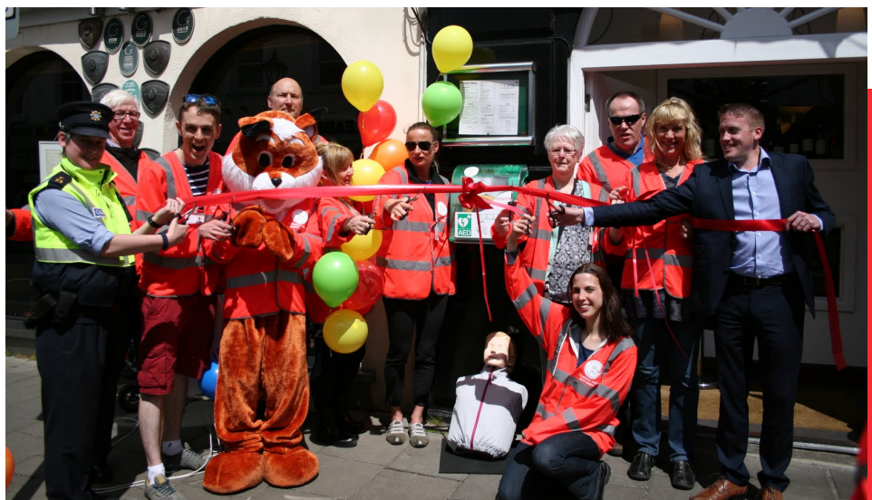
Dalkey CFR Committee members at the launch of their first Public Access AED

Have you won any awards? Dalkey CFRs were awarded the Dalkey Community Council Endeavour Cup last year!