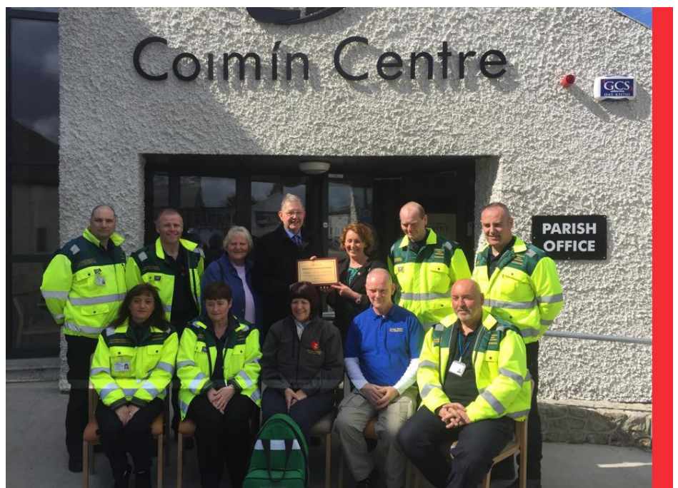
Blessington CFRs' Heartsaver award being accepted by one of the Cardiac Arrest survivors attended by the group.